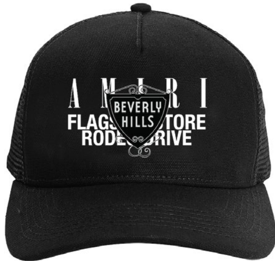
AMIRI x BEVERLY HILLS HAT MSRP: $320